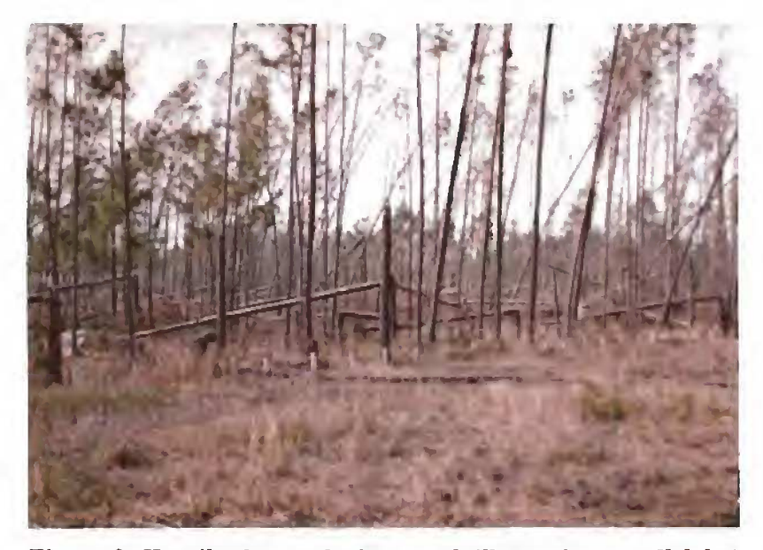
Figure 2. Heavily damaged pine stand illustrating parallel but opposite direction alignment of fallen trees. This effect was caused by passage of the "eye" of Hurricane Camille through Bay St. Louis-Pass Christian area.